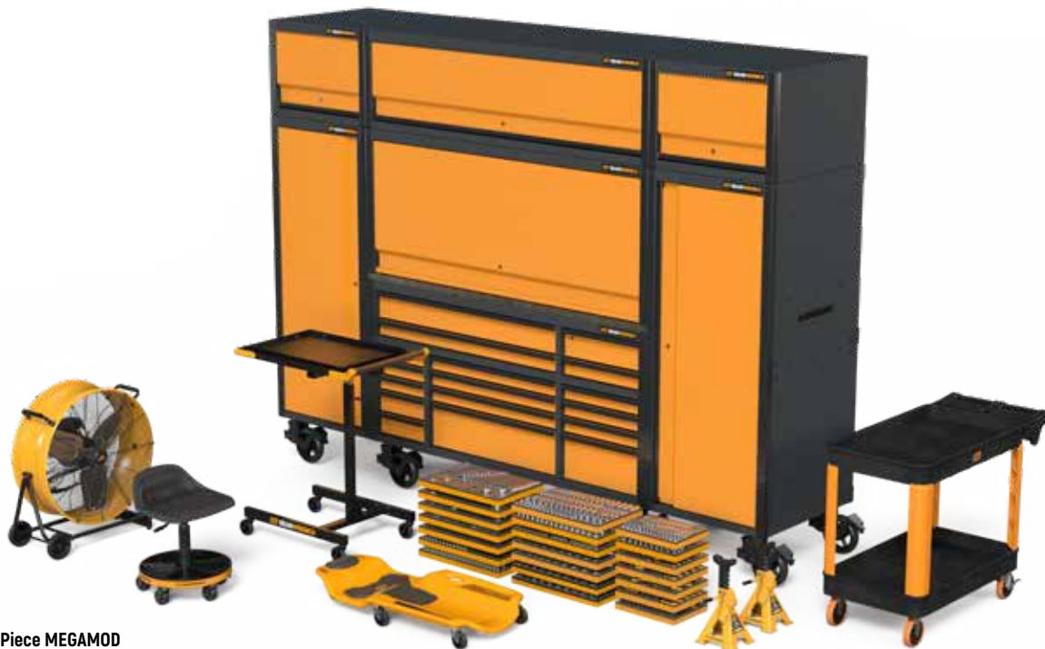
1858 Piece MEGAMOD Master Technician Set