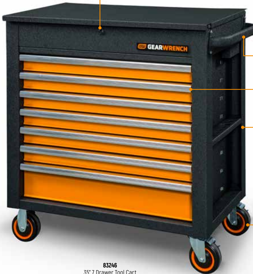
83246 35" 7 Drawer Tool Cart

Heavy Duty Industrial Polyurethane Casters 2 Fixed and 2 swivel, providing easy mobility. Each caster weight rated at 450 lbs.