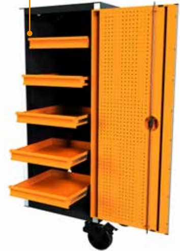
83249SL 72" Tool Cabinet Side Locker

Side Handle and Extra Casters Included For ease of assembly operations