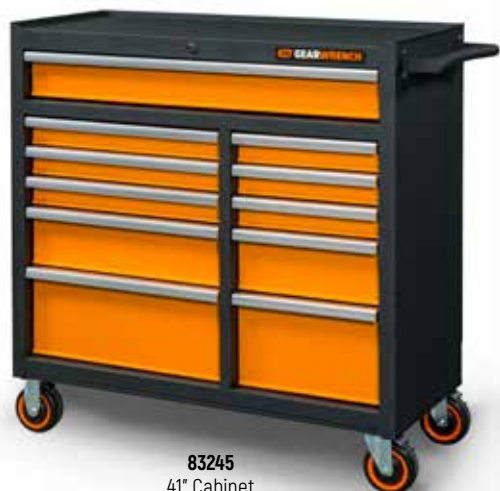
83245 41" Cabinet