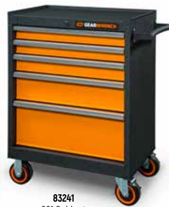
83241 26" Cabinet