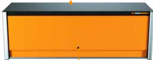
83249HTC 72" Tool Cabinet Hutch

Hutch Cover with Gas Struts And aluminum drawer pull combined allow smooth operation on opening and closing