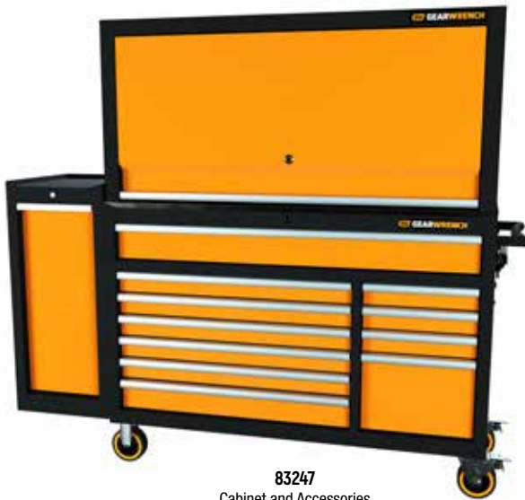
83247 Cabinet and Accessories