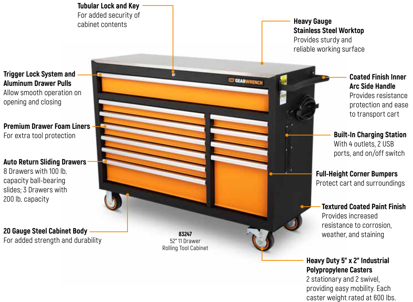
83247 52" 11 Drawer Rolling Tool Cabinet