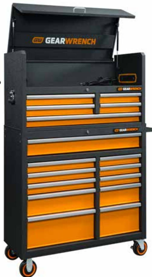
41" Chest and Cabinet Combination