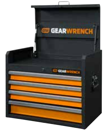
83240 26" Chest