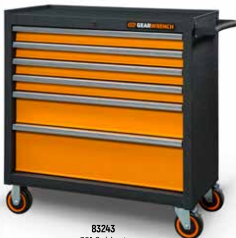
83243 36" Cabinet