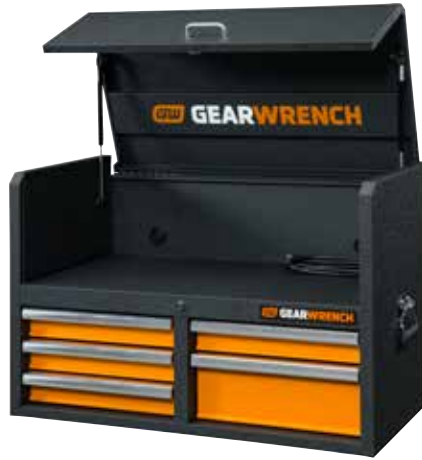
83242 36" Chest