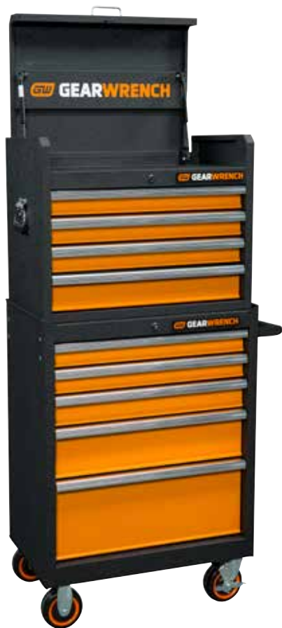
26" Chest and Cabinet Combination