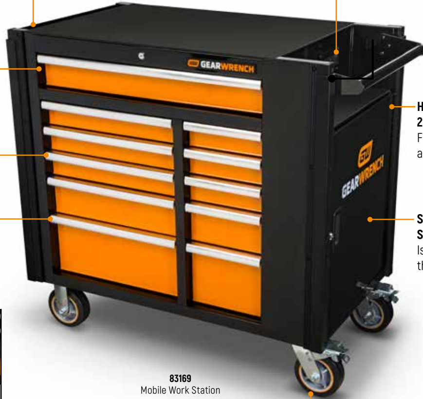
83169 Mobile Work Station

Secure Lockable Side Cabinet Is separate from the drawers