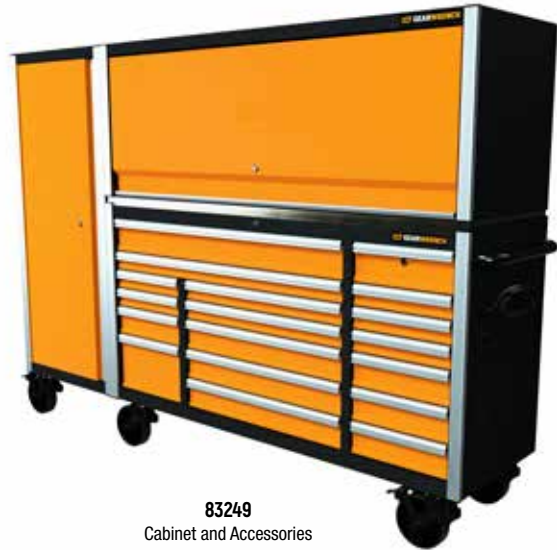
83249 Cabinet and Accessories