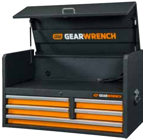
83244 41" Chest