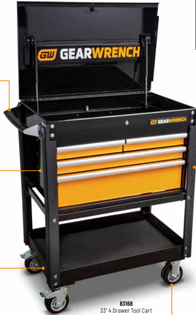
83168 33" 4 Drawer Tool Cart

Heavy-Duty Polyurethane Casters 2 stationary and 2 dual-locking that lock caster pivot and wheel rotation