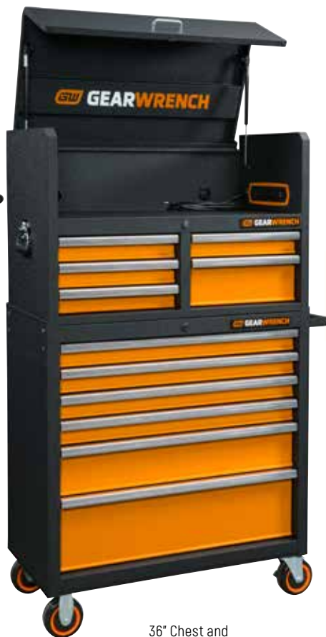
36" Chest and Cabinet Combination