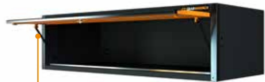
83238LTL 72" Pro Tool Cabinet Large Top Locker