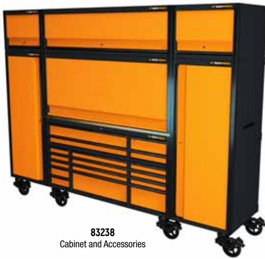
83238 Cabinet and Accessories