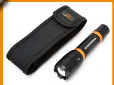
83123P - Flashlight Holster specifically for 83123

Rechargeable lithium-ion battery providing up to 5 hours run time